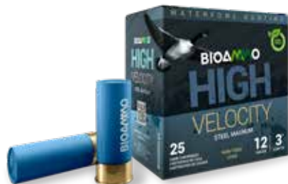
25 cartridges box 250 cartridges case

High Velocity cartridges especially designed for waterfowl and manufactured with lead-free loads .