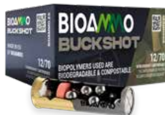
10 cartridges box 200 cartridges case