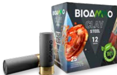
25 cartridges box 250 cartridges case