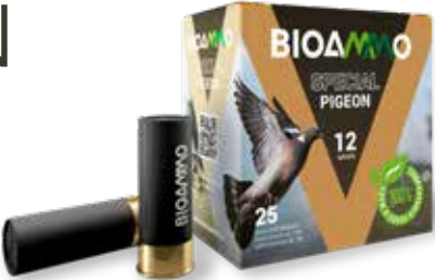
25 cartridges box 250 cartridges case