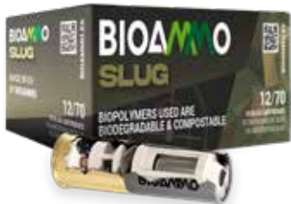
10 cartridges box 200 cartridges case

Highly lethal due to the controlled opening of its fins.