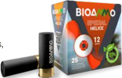
25 cartridges box 250 cartridges case