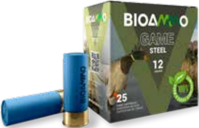
25 cartridges box 250 cartridges case

Premium performance steel shot cartridges particularly suited for wetland areas, without impacting on the aquifers or the environment.