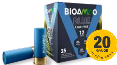
25 cartridges box 250 cartridges case

With almost the same softness, lethality and penetration as lead. Premium performance too and without ricochet.