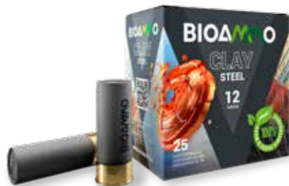
25 cartridges box 250 cartridges case