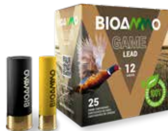
25 cartridges box 250 cartridges case

Specifically designed for the game shooter who is seeking an excellent cartridge with premium quality and performance efficiency, and without any single-use plastics.